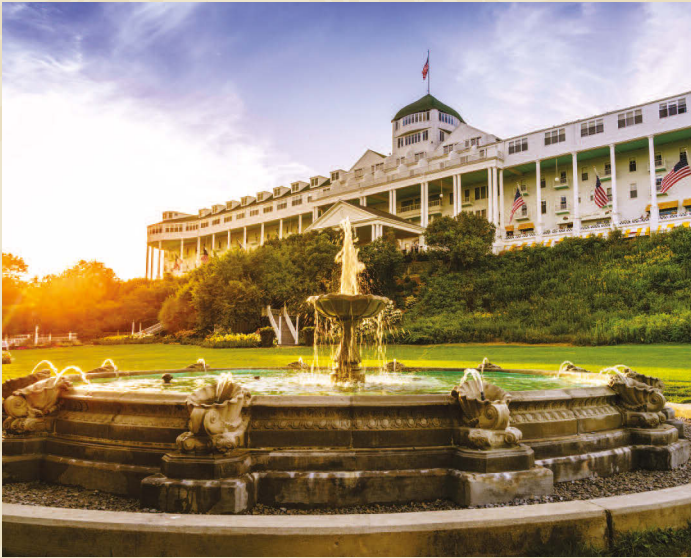
The magnificent Grand Hotel on Mackinac Island

visit Veldheer-DeKlomp Tulip Gardens, Holland's only tulip farm ablaze with acres of tulips in brilliant color in a Dutch setting of windmills, drawbridges and canals. You may also wish to shop for Delftware, the famous Dutch pottery or be fitted for a pair of wooden shoes. Meals: B, D