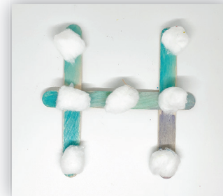
Glue the cotton balls onto the H.