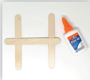
Glue your popsicle sticks into an H.

Supplies to find at home: glue and cup of water.